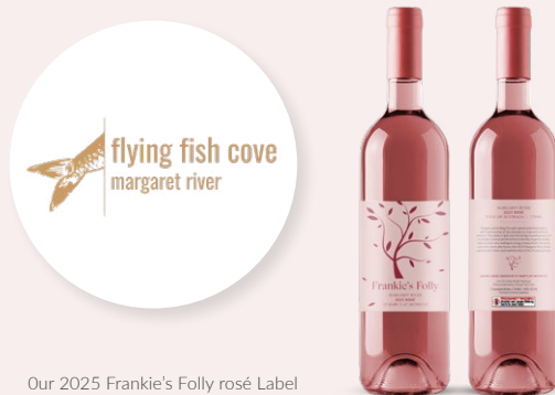
Our 2025 Frankie's Folly rosé Label

Flying Fish Cove has begun producing our Frankie's Folly wines, and we are delighted to introduce our new rosé. For details on our current wines and to place an order, visit frankiesfolly.com.au .